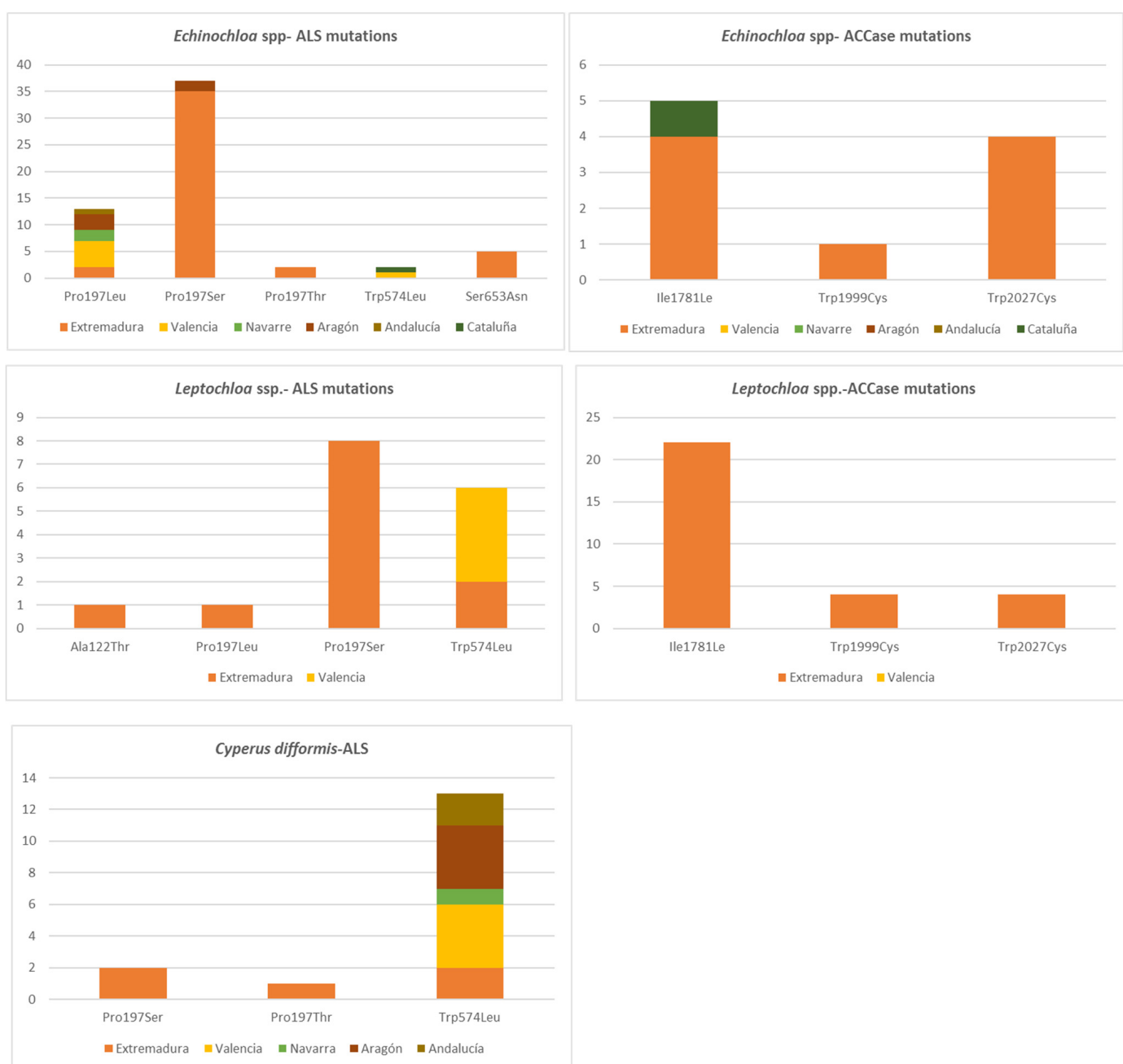
Figure 3. Different mutations in ALS and ACCase genes in individuals of Echinochloa spp., Leptochloa spp., and Cyperus difformis collected from different rice-growing areas of Spain.

(2019) [33]. Evolved resistance to ALS-inhibiting herbicides in weeds has been attributed to substitutions at each of the following eight different amino acid positions: Ala-122, Pro-197, Ala-205, Asp-376, Arg-377, Trp-574, Ser-653, and Gly-654. Codon changes at positions 1781, 1999, 2027, 2041, 2078, 2088, and 2096 have been previously described as causing resistance to ACCase-inhibiting herbicides. The tests were performed using pooled samples, and so the mutation frequency within the population was not determined. The results are shown in Figure 3.