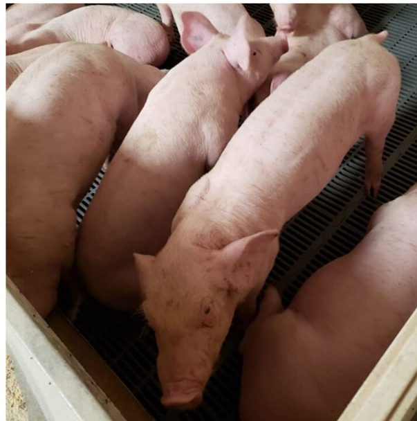
FIGURE 1 Postweaning pig suffering from the so-called 'flying pig syndrome' with wasting and thrown-back ears

Tissue samples (superficial inguinal and submandibular lymph nodes, Peyer's patches, tonsil, heart, central nervous system [CNS] – cerebrium, cerebellum and pons –, kidneys, lungs, spleen, large and small bowel, liver and/or nasal turbinate) were collected and fixed by immersion in a 10% buffered formaldehyde solution for 48 h. Tissues were subsequently embedded in paraffin wax, sectioned at 3 µm,