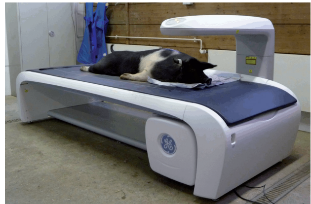
Figure 1. Scanning of a live pig by dual-energy X-ray absorptiometry (DXA).

The DXA is an improved form of X-ray technology that is used mainly to measure bone density (Fig. 1)