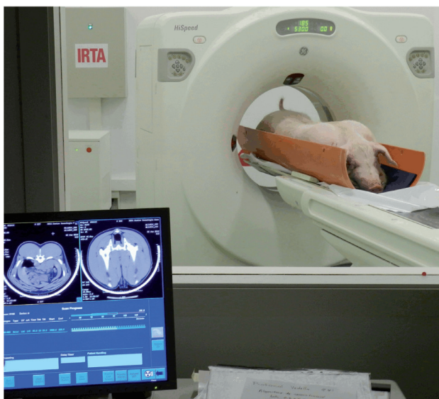
Figure 2. Scanning of a pig by computed tomography (CT) at 120 kg at IRTA's installations.

tion traits. Although the image is presented in 2D, the width of the X-ray used permits the calculation of the density and the real volume. As CT provides 3D images, the measurements obtained with this device are good predictors of body composition in live pigs (Luiting et al. , 1995) and pig carcasses (Font i Furnols & Gispert, 2009). Due to the emission of X-rays, the equipment must be isolated in a room with leaded walls, and during scanning, the operator is in another room close to the device with a leaded window to visualise the scanning while it occurs.