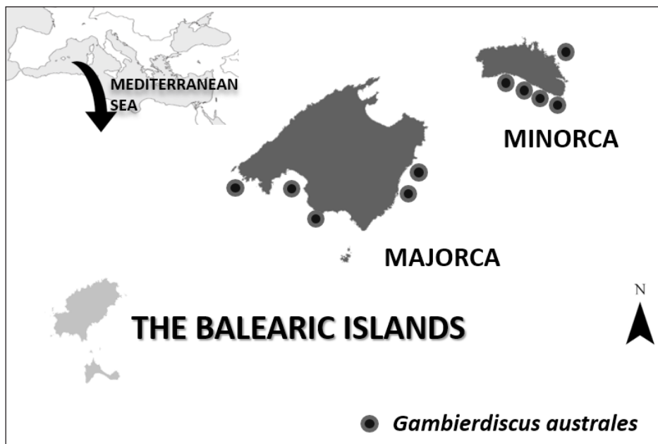
Fig. 2. Locations where Gambierdiscus australes was recorded in the Balearic Islands (39° 30'N, 3° 00' E), Spain.

[10]. The Mediterranean Sea, which is a semi-enclosed sea, seems to be one of the regions strongly affected by the rising of temperatures, and this makes this region more suitable for tropical species [11]. A recent study describes a high diversity of Gambierdiscus species in the Canary Islands which would suggest that this genus is not a recently introduced taxon in that area, although climate change may contribute to increase the populations density [2].