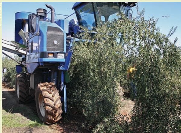
Super-high-density hedgerow planting systems for olives employ over-the-row harvesters (shown, in California).

Vegetation. In December 2009, the average tree height had reached 107 inches, 5.3 times the initial growth of the previous year, with a maximum of 7.6 times more growth for 'Arbequina' and a minimum of 2.2 times more for 'Urano' (table 1). Only the crown width of 'Coratina' exceeded 79 inches by