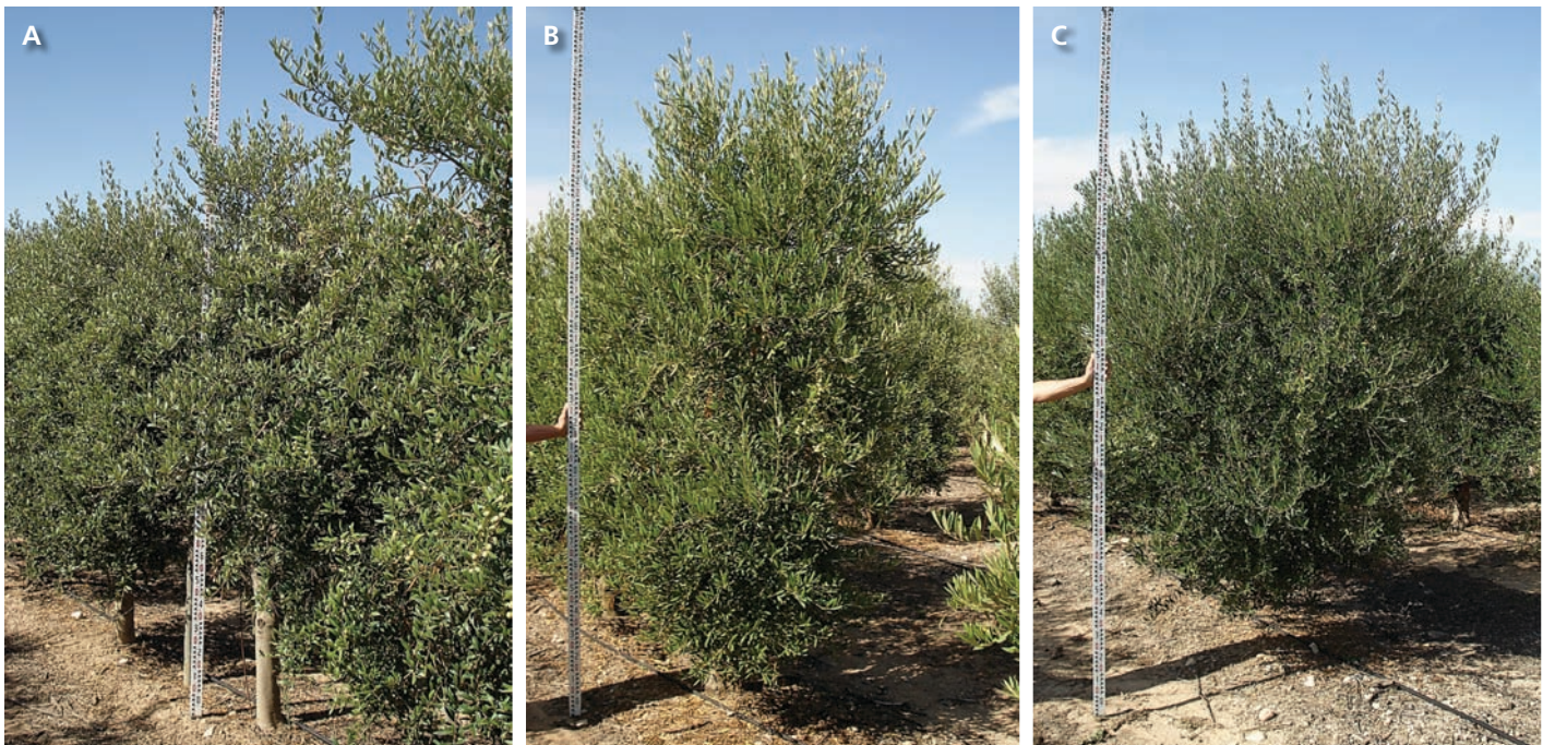
The growth habit of 11-year-old trees is shown for the IRTA clones (A) 'Arbequina i-18' (B) 'Arbosana i-43' and (C) 'Koroneiki i-38', in a hedgerow, super-high-density planting system in 2009, in Spain.

The first comparative field trial with these clones in super-high-density hedgerow orchards was planted in