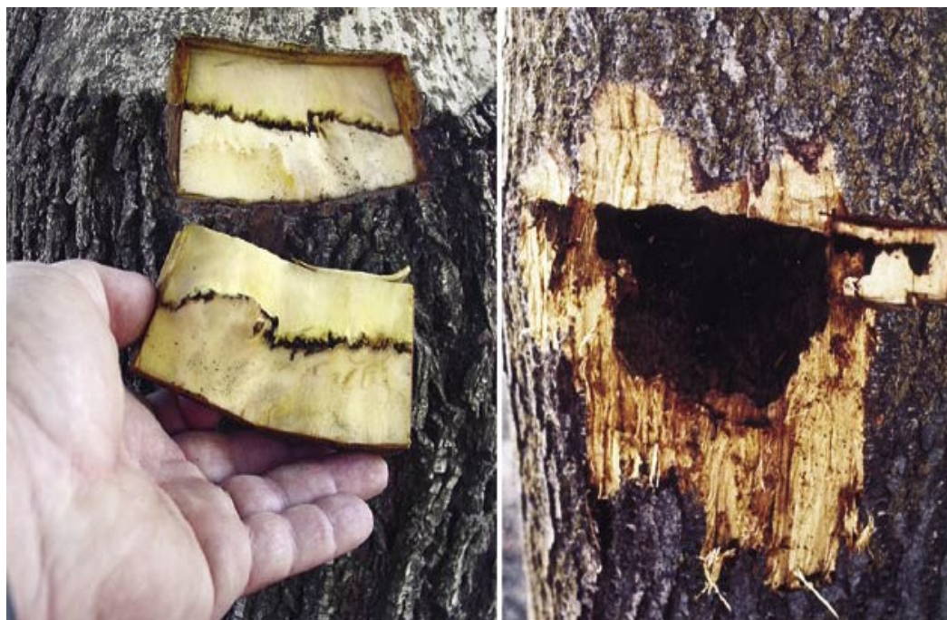
Figure 2. Symptoms of blackline disease in walnut at graft union.

In California, screening of a huge multi-species Juglans population, J. regia , J. microcarpa , J. major , J. cathayensis , and others and targeted interspecies hybridization between the selected superior genotypes to produce rootstocks resistant to the soil borne pathogens, Agrobacterium tumefaciens , Phytophthora spp.; Pratylenchus vulnus , and Armillaria mellea , has been in progress for several years and is continuing [246]. Crown gall ( Agrobacterium tumefaciens ) is a major rootstock issue in walnuts, particularly when using Paradox hybrid rootstocks. This bacterial disease can significantly reduce production and increase management costs. The RNAi technology, RNA interference has been used experimentally to suppress genes involved in the plant response to the bacterium [247]. Silencing of tryptophan monooxygenase ( iaaM ) and isopentenyl transferase ( ipt ) genes blocks bacterial induction of de novo auxin and cytokinin and therefore prevents gall development [248].