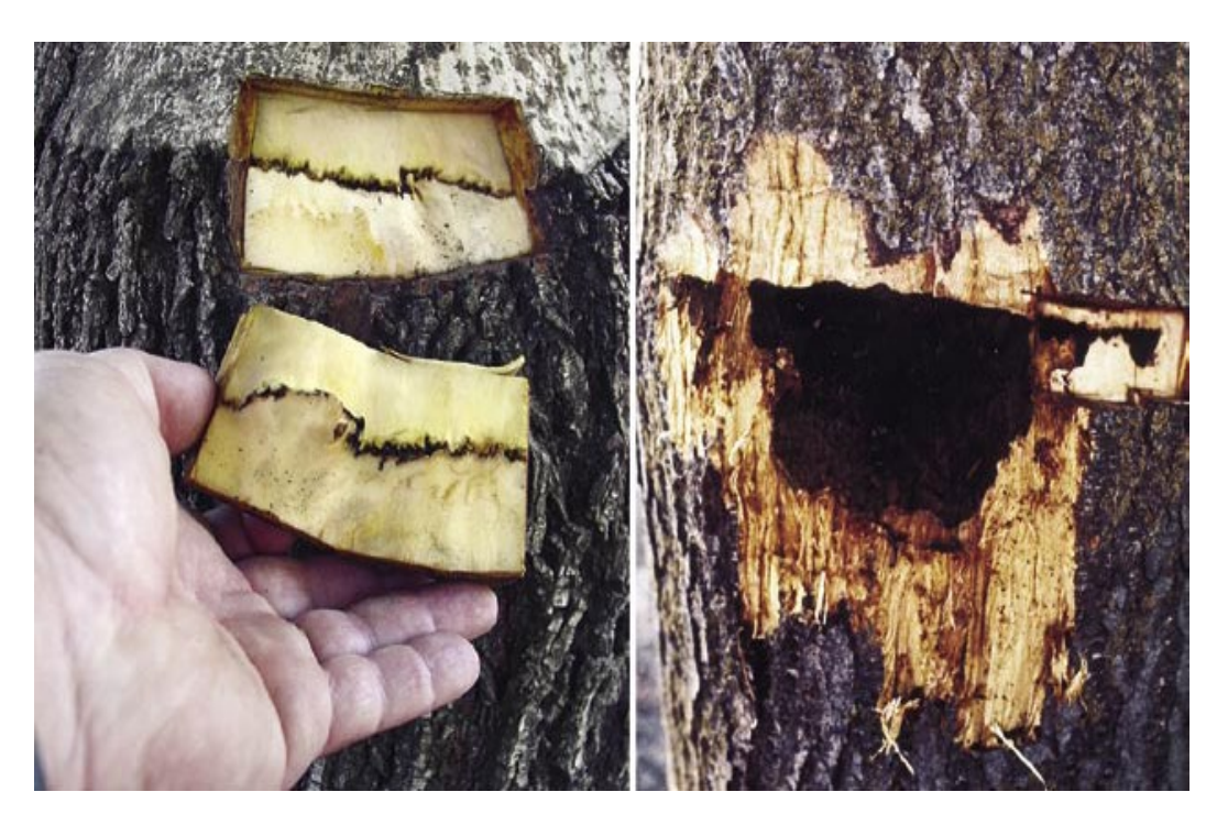
Figure 2. Symptoms of blackline disease in walnut at graft union.

In California, screening of a huge multi-species Juglans population, J. regia , J. microcarpa , J. major , J. cathayensis , and others and targeted interspecies hybridization between the selected superior genotypes to produce rootstocks resistant to the soil borne pathogens, Agrobacterium tumefaciens , Phytophthora spp.; Pratylenchus vulnus , and Armillaria mellea , has been in progress for several years and is continuing [246]. Crown gall ( Agrobacterium tumefaciens ) is a major rootstock issue in walnuts, particularly when using Paradox hybrid rootstocks. This bacterial disease can significantly reduce production and increase management costs. The RNAi technology, RNA interference has been used experimentally to suppress genes involved in the plant response to the bacterium [247]. Silencing of tryptophan monooxygenase ( iaaM ) and isopentenyl transferase ( ipt ) genes blocks bacterial induction of de novo auxin and cytokinin and therefore prevents gall development [248].